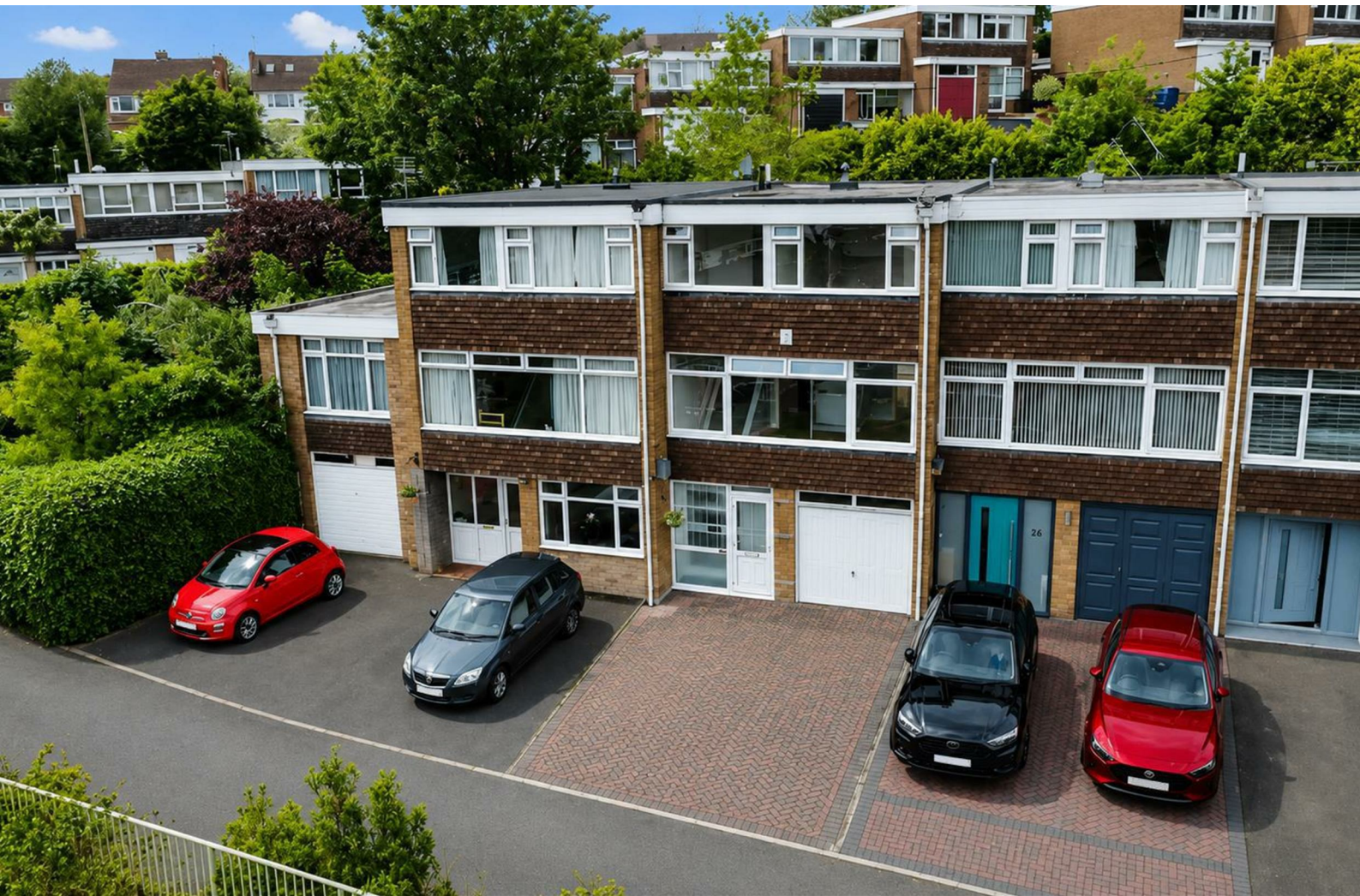
36 Redhill Close, Stourbridge, DY8 1NF